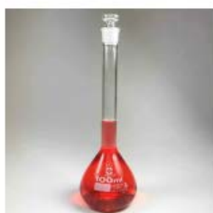
d) Volumetric flask