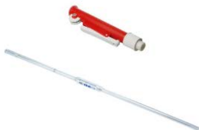
b) Glass Pipette and Pipette Filler