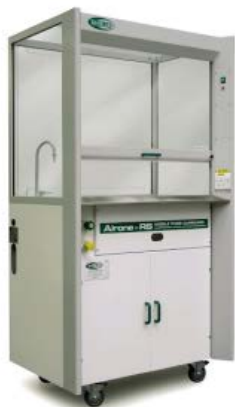
a) Fume Hood / Cupboard

Write a sentence to describe how each piece of equipment works – you might find it helpful to watch videos so you can see how they are actually used (b-f).