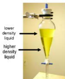
e) Separating Funnel