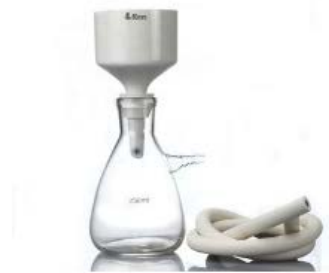
f) Buchner funnel (vacuum filtration)